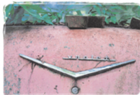
c'est La vie A103