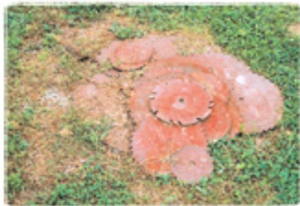
NATURE AND INDUSTRY BLEND A150