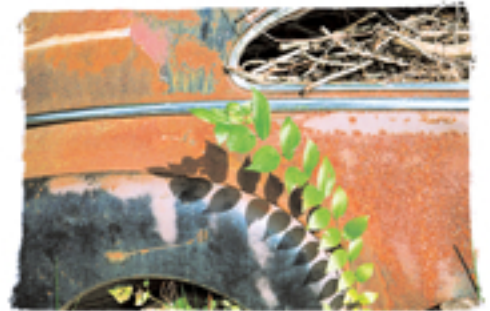
NATURE AND INDUSTRY ALIGN A112