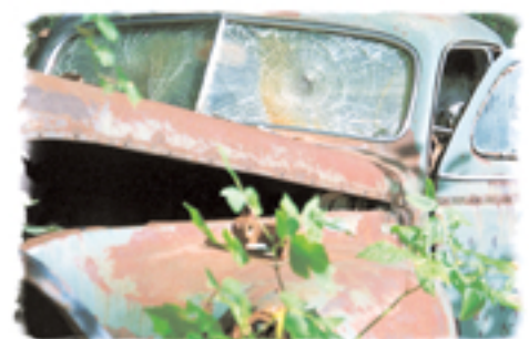
PETROSAURUS REX A115

"Oil is History" is a trademark of Louise Anne Marler's, which includes all these images and captions, plus more!