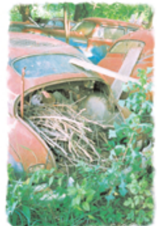
R. I. P. - RUST IN PEACE A107