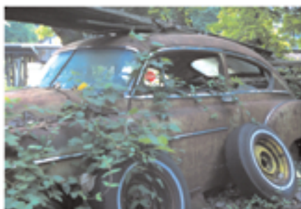
STOP BURNING FOSSIL FUELS A141