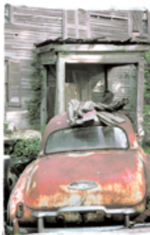
DRIVE THROUGH A106