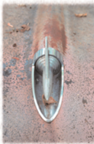
OIL IS HISTORY A138