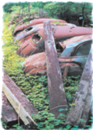
RUSH HOUR PARK A117